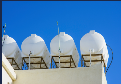
ROOF WATER TANKS